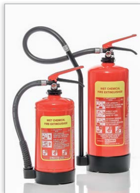
FBDP 3 and FBDP 6