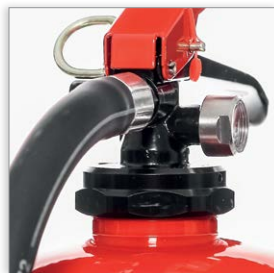
FBDP 3 - valve