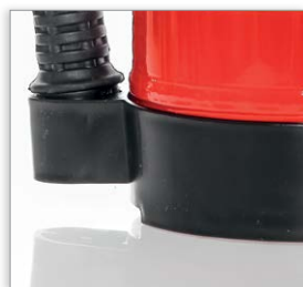
FBDP 3 - foot-ring with integrated hose retainer.